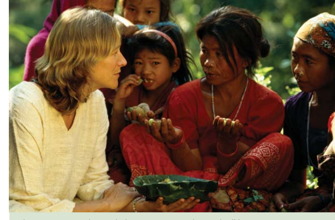
There are many resorts and spas involved in community projects - here are a handful to inspire you.

family holidays to yoga ashrams. "Working as a volunteer at Sanglah hospital after the Bali bomb, it was a transforming experience to see how everyone came together in a tragedy and worked for others," she remembers. "It really showed me the potential of humanity, and it showed me that even in tragedy there is so much beauty. Weird but true."