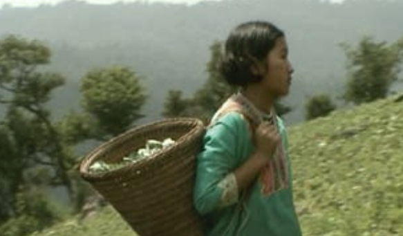
North Andaman Tsunami Relief www.northandamantsunamirelief.com Wild Earth Nepal, www.wildearthnepal.com The Body Shop, www.thebodyshop.com International Eco-tourism Society www.ecotourism.com Product Red, www.joinred.com Innocence, www.pigonine.com Lonely Planet, www.lonelyplanet.com